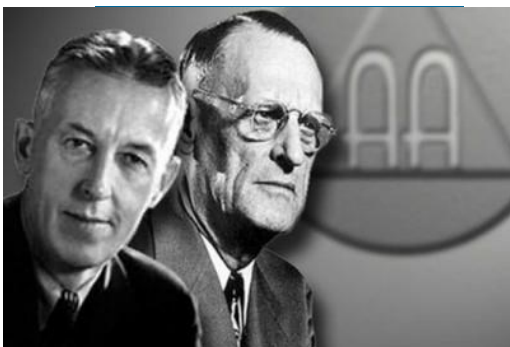
Bill W. & Dr. Bob

The 1940 “Akron Manual for Alcoholics Anonymous” can be found at the following website: