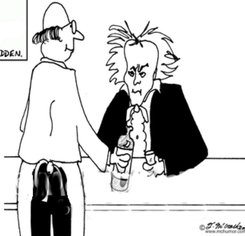
BEETHOVEN WORKING ON HIS FIFTH.