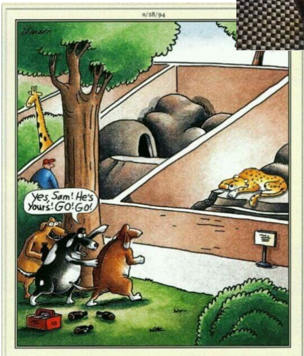
Dogs and alcohol: The tragic untold story.