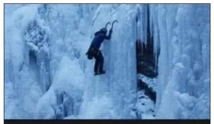
Rare footage of my parents on their way to school